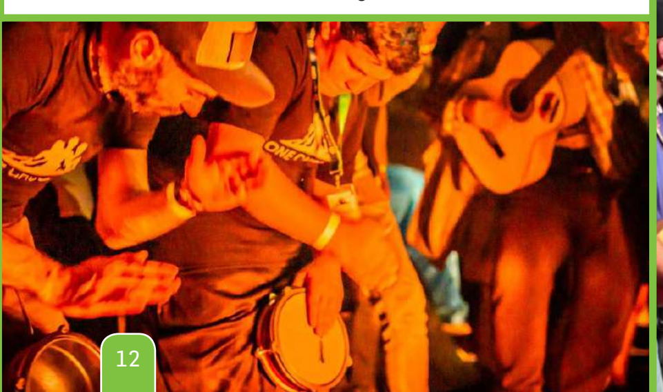
So far 505 musicians and dancers from 75 bands and ensembles have co-created 37 new international music projects during the 8 years of the festival.

One Caucasus brings musicians to the Festival not just to present their own music to the audiences but to work together with other musicians who come from other countries and who represent other genres. You will find fusions of all types of sounds and musical styles: traditional Georgian polyphonic music, Armenian punk-rock, Jamaican gospel, Azerbaijani mugham, American modern jazz, French afro-blues, Nigerian reggae, Senegalese funk, Polish hip-hop, Ukrainian ethnic-ska and many more! Musicians are teamed up for joint rehearsals and for concerts. These rehearsals lead to exciting new projects which are presented for the very first time to the One Caucasus audience on the main stage.